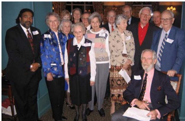
The CHS Alumni of Winchester Gardens

It was a special evening both in bringing together old friends and old memories along with updating alumni on current happenings at CHS.