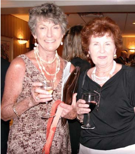
Members of the Class of 1961 at Reunion, Spring 2006